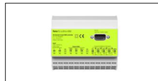
fc s.dmx 48d