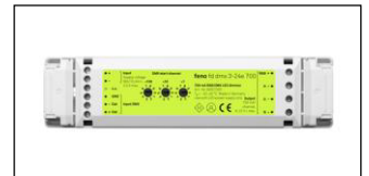
fd dmx 3-24e 700