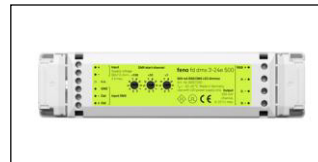
fd dmx 3-24e 500