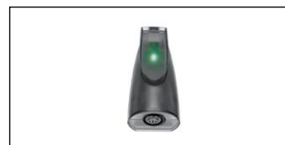
fc dmx 512u