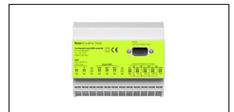
fc s.dmx 144d