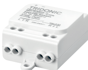
basicDIM wireless Module