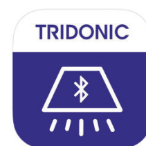
App - 4remote BT