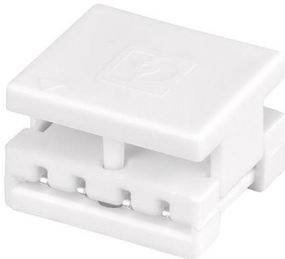
ACL connector PCB-PCB