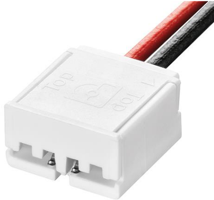
ACL connector Wire-PCB