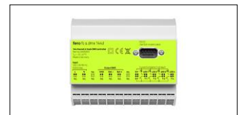
fc s.dmx 144d