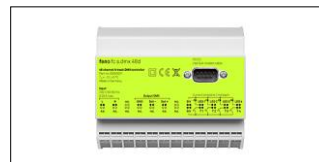
fc s.dmx 48d