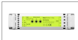
fd dmx 1-24e