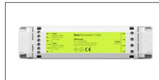
fd booster 1-24e