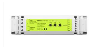
fi dmx-dsi 1e