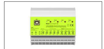
fc s.multi 4d